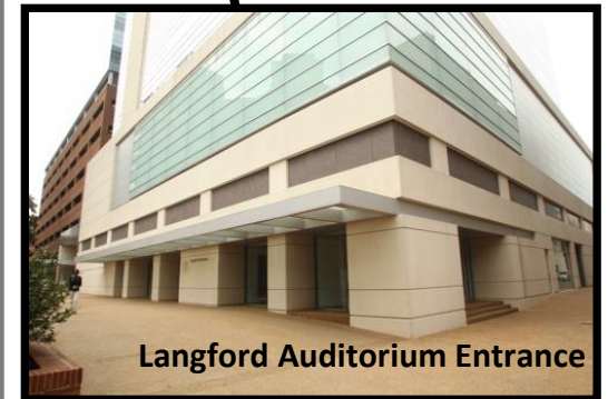
Langford Auditorium Entrance

Google Maps: Type in "Langford Auditorium" in the Google Maps search bar to guide you right to the building.